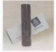
15" x 50 yds as low as