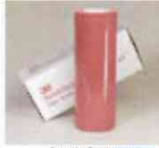
15" x 50 yds as low as