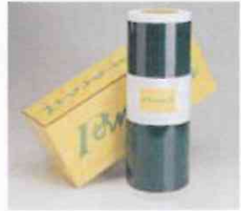
Sample Card XCARD 15" x 50 yds as low as