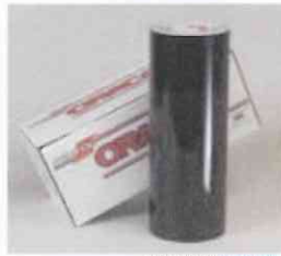
Sample Card DHPCARD 15" x 50 yds as low as