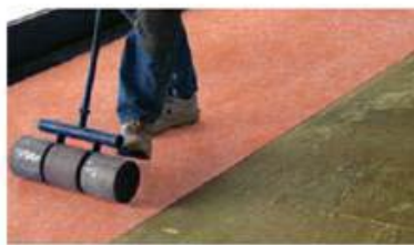
Embed TS with Roller.