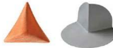
Inside & Outside/Dam Corners

The Tenant shall sleeve, firestop, flash and caulk all penetrations so as to provide an adequate seal. Examples shown: