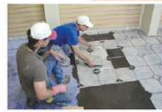
Install Tile by a Thin-Bed Method.