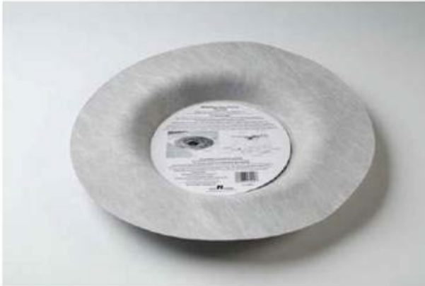
NobleFlex Drain Flashing

Use NobleFlex Drain Flashing when drain clamping ring is below the finished floor.