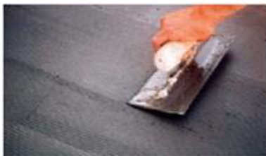
Apply Bonding Agent (latex modified thin-set).