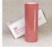
Sample Card 3M CARD