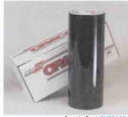
Sample Card OHPCARD 15" x 50 yds as low as