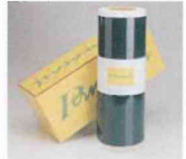
Sample Card XCARD 15" x 50 yds as low as